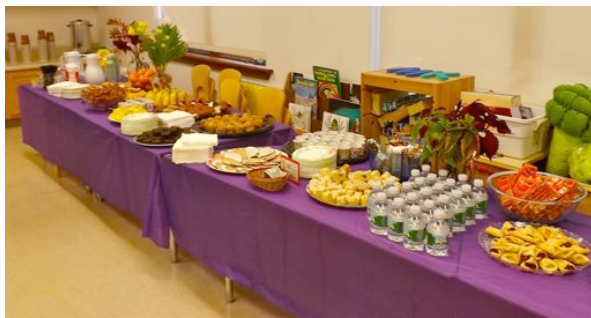
Hospitality Room Table prepared by the Services Team

NO REGISTRATION REQUIRED. THERE WILL BE A CALL FOR RESERVATIONS PRIOR TO EACH FILM.